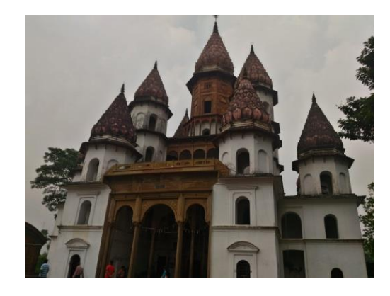
Figure: Dakshineswar Temple and Hanseswari Temple