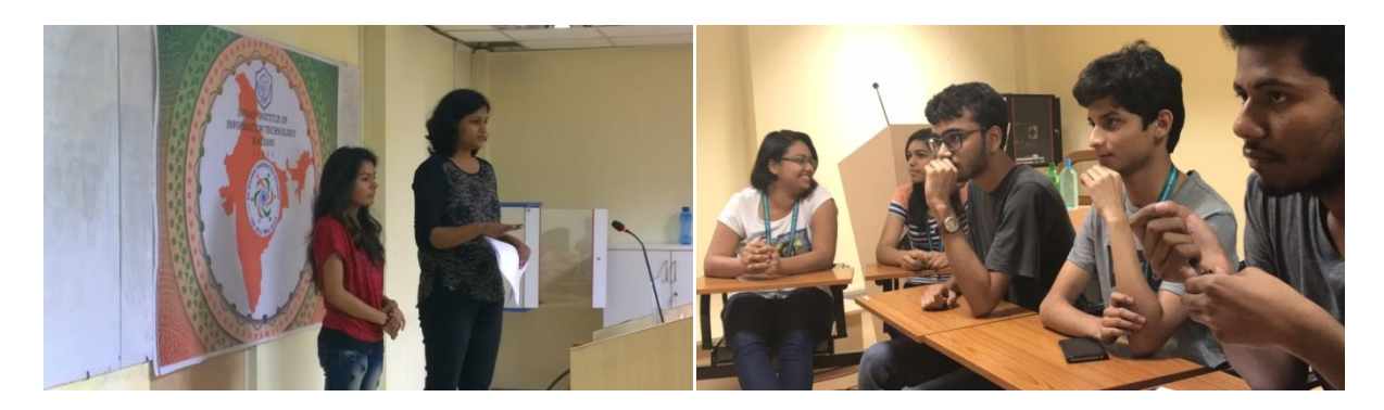
Figure: EBSB Celebrations