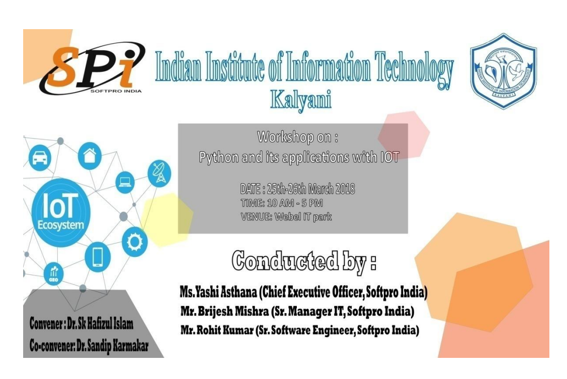
Figure: Banner of the Python Workshop.