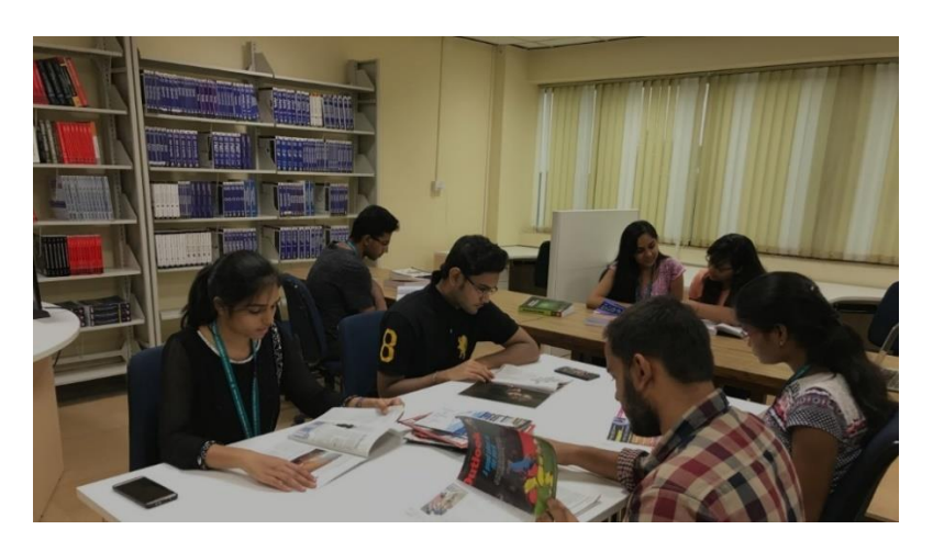
Figure 11: Students studying at library