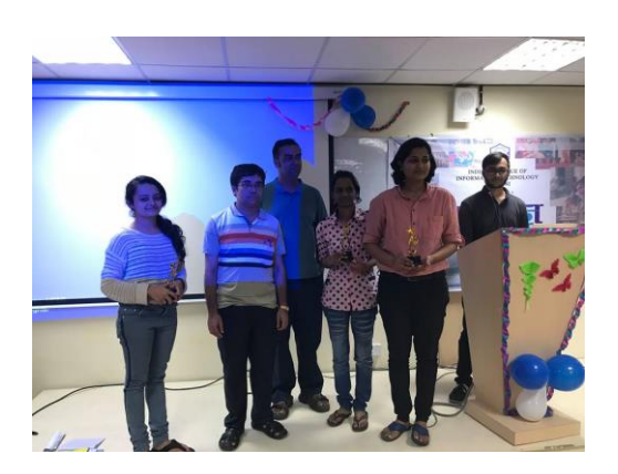
Figure: Culrural Events on Paryatan Parv